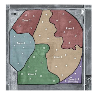
Zone Sampling Map